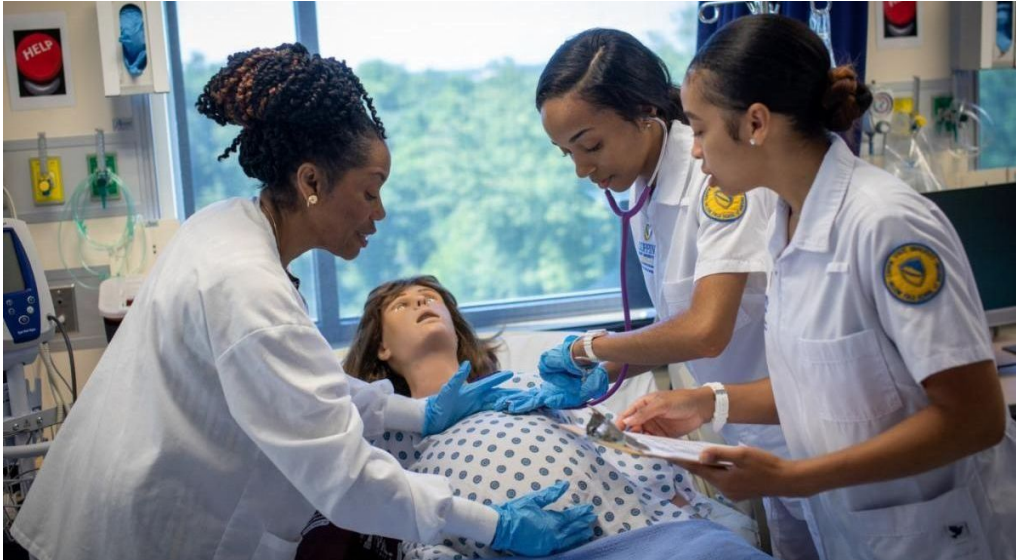
Students in CSU's College of Health Professions get hands-on instruction at two health care simulation facilities.