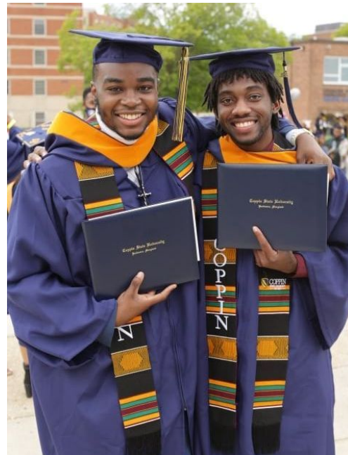
CSU graduates celebrate at their commencement last May. The USM's three HBCUs awarded nearly 2,100 degrees in 2021.

In Maryland, settlement of a lawsuit filed to compensate for the long-term underfunding of our HBCUs brought $577 million to the state's four historically Black institutions: BSU, Coppin State University (CSU), the University of Maryland Eastern Shore (UMES), and Morgan State University. (Morgan is the only HBCU in Maryland that's not part of the USM.)