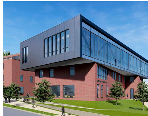
CSU's new College of Business building, opening this year, will house an innovation hub for entrepreneurs, startups, and small businesses.

The Charles Schwab collaboration will focus on faculty development, curriculum design, and education pathways that help students enter careers in the wealth management industry, including as Certified Financial Analysts and Certified Financial Planners. The multiyear partnership will also provide scholarships for CSU students, support an annual Closing the Wealth Gap Summit on campus, establish a community-focused center, and create a Minority Registered Investment Advisor (RIA) Mentorship Program. RIA positions will focus on serving local people and local neighborhoods, creating and sustaining wealth in communities long deprived of it.