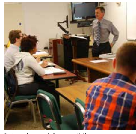
Business classroom in Framptom Hall