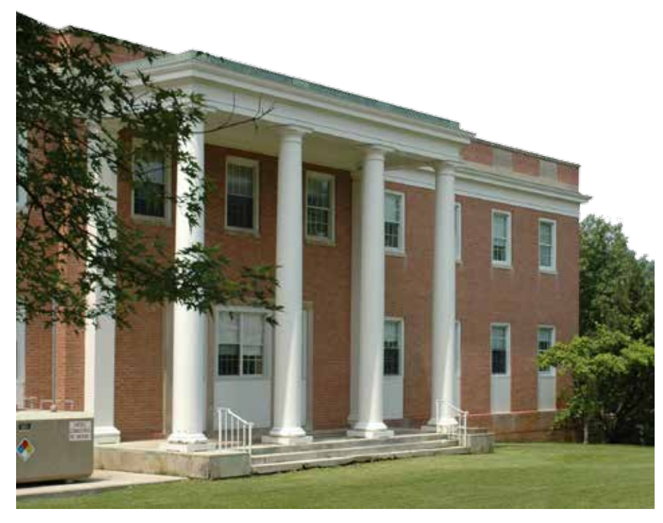
Framptom Hall, the current home of Educational Professions and the College of Business, was constructed in 1965 to serve as the college library.