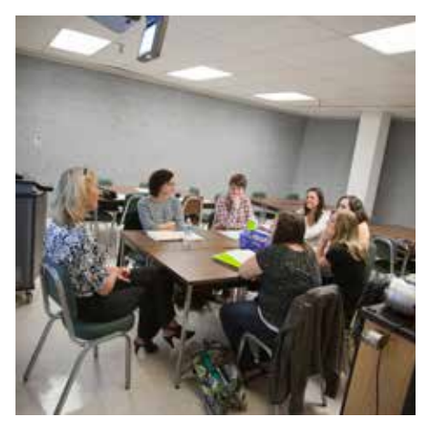
Education classroom in Framptom Hall