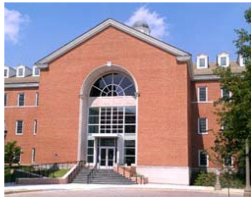
Front entrance of Administration Building After exiting the visitor parking garage, walk left.