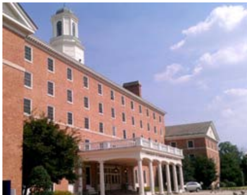
Front entrance of Inn and Conference Center After exiting the visitor parking garage, walk right.