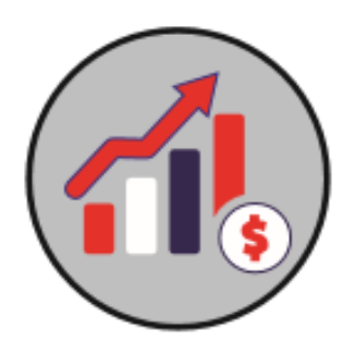
Promote U.S. Economic Stability