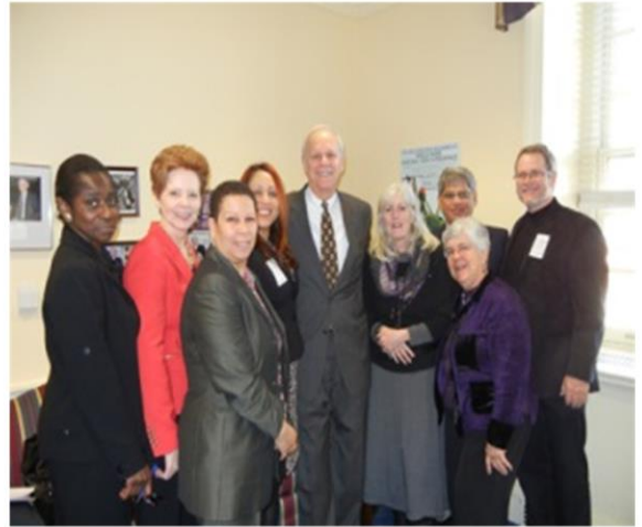
CUSF Reps. with Senator Paul Pinsky