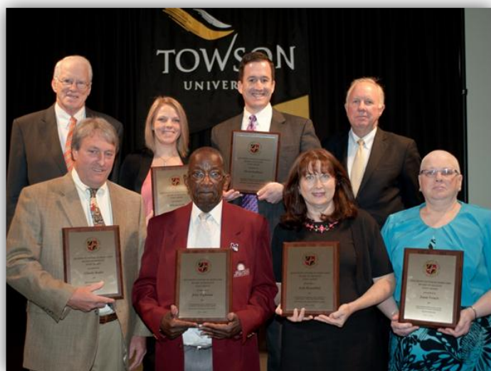
Board of Regents Staff Awards Recipient Reception September