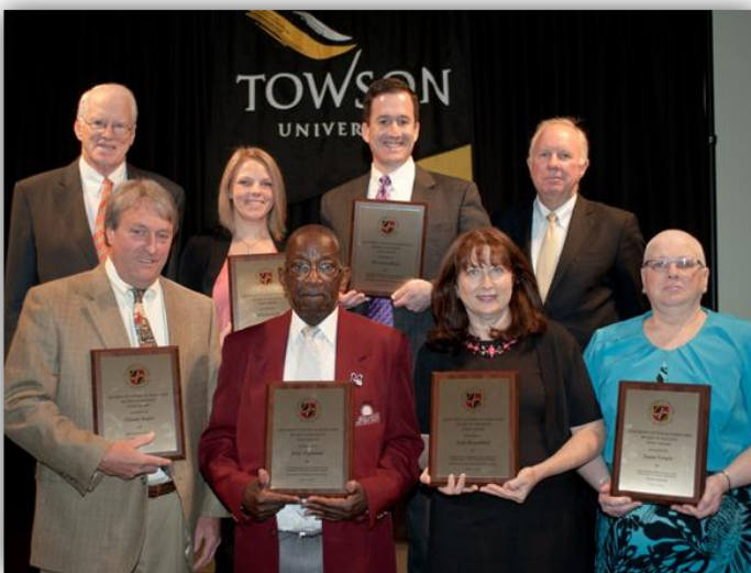
Board of Regents Staff Awards Recipient Reception September