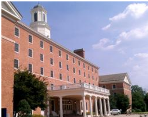
Front entrance of College Park Marriott Hotel and Conference Center

After exiting the visitor parking garage, walk right.