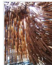
MA 124 Contemporary Mathematics