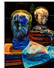
SS 151 Intro