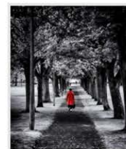
Enhanced College Writing Lumen Learning