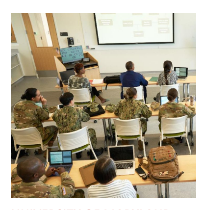
UNIVERSITY OF MARYLAND GLOBAL CAMPUS

UMES announced $1.5 million in federal support for its Entrepreneurship and