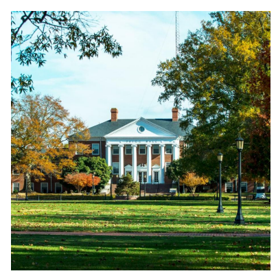
UNIVERSITY OF MARYLAND EASTERN SHORE

Seven UMCP faculty members were recently announced as fellows by the American