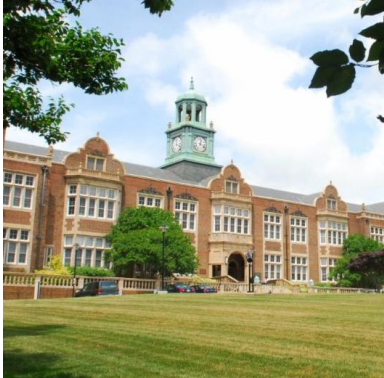
TOWSON UNIVERSITY TU was selected as the newest member of the <u>First Scholars</u> <u>Network</u> for commitment to improving experiences and advancing outcomes for firstgeneration college students.