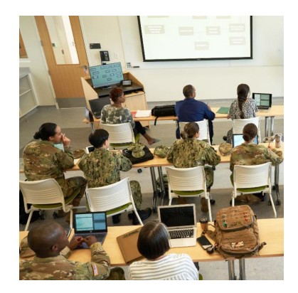
UNIVERSITY OF MARYLAND GLOBAL CAMPUS UMGC has been awarded a new, five-year contract by the U.S. Department of Defense to educate U.S. troops across Europe. The award begins August 1, 2023, and runs through July 31, 2028.

-for the first time-included an integrated environmental justice index in the evaluation.