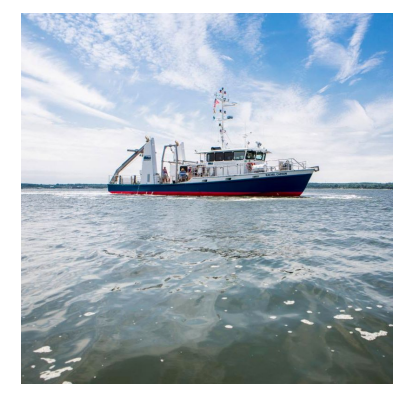
UNIVERSITY OF MARYLAND CENTER FOR ENVIRONMENTAL SCIENCE UMCES issued its annual Chesapeake Bay and Watershed Report Card, which