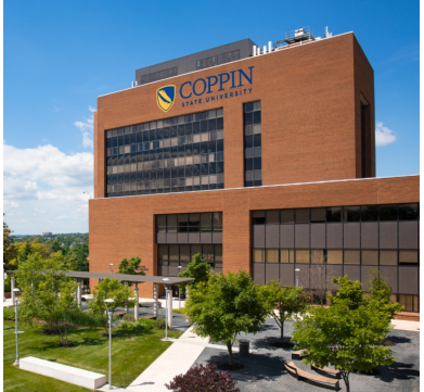
COPPIN STATE UNIVERSITY CSU launched <u>Coppin Corner</u>, a new on-campus resource committed to serving Coppin State students by providing basic needs to foster continued academic progress and increase the retention of students in need.