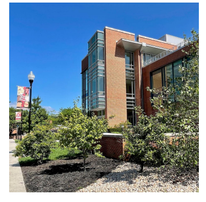
FROSTBURG STATE UNIVERSITY FSU will be hosting students from Allegany and Garrett Counties at the <u>Bobcat</u> <u>Academy</u>—a dual enrollment pilot program next fall.