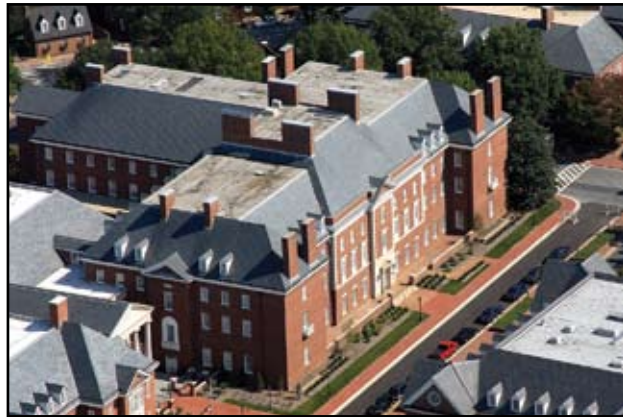
Lowe House Office Building

encompasses 83,900 gsf and is estimated to cost $6,497,000. This project is unique in that it will be the State's first green renovation project and will utilize the LEED for Existing Buildings (EB) rating system. The architecture and engineering (A/E) selection process is scheduled to begin this fall.