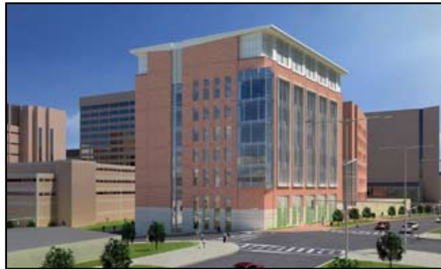
Pharmacy Hall Addition

LEED certification activity. The project will allow the School of Pharmacy to expand its current enrollment by 82% and partially address the State's shortage of trained pharmacists. This project is currently in the early stages of construction including excavation and demolition. During this current work, the primary LEED-related activities include construction waste management and recycling with the goal of diverting 50-75% of non-hazardous construction and demolition waste from disposal, to redirect recyclable materials back into the manufacturing stream, and to redirect reusable materials to appropriate sites. The recycled materials include concrete, plastic, brick, acoustic tile, glass, carpet, insulation, and gypsum wall board. The project will involve 112,565 gsf at a cost of $78,027,000.