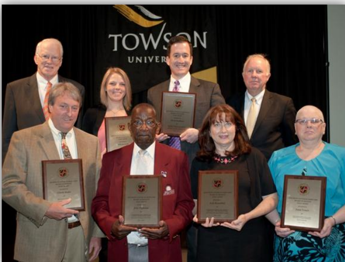
Board of Regents Staff Awards Recipient Reception September