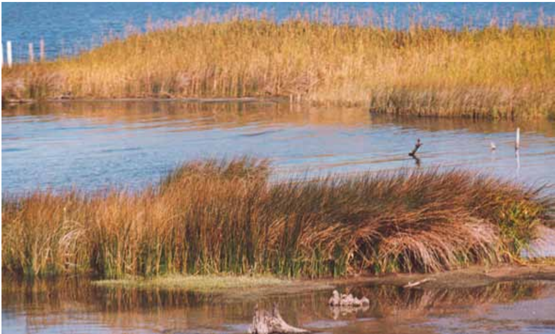
Wetlands of the Eastern Shore, home to Salisbury University, UMES and UMCES.