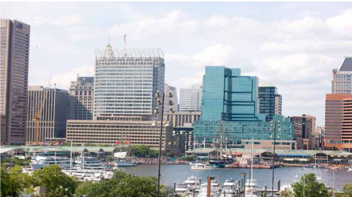
Baltimore, home to Coppin, UB, UMB, and UMBI.

The Committee is pleased with the increased number of nominations this year and will closely look at the BOR Awards program policy to encourage the USM schools to submit an even greater number of nominations in the future. The Committee is also in the process of reviewing the Awards program with the intention of making recommendations to update and enhance the USM Award to the regents. The Staff Awards program was modeled after the Regents Faculty Awards. The Faculty Awards program has undergone several changes over the years including expansion to increase the number of awards given. The Staff Awards program, however, has not undergone any changes since its inception.