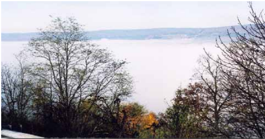
Blanket of thick fog hides the town of Frostburg, home to Frostburg University.

This committee reviewed the State Blue Ribbon Commission's draft report from December, 2008 on health benefits for retirees and is attempting to monitor any additional committee activities/meetings which might occur. There does not appear to be any further actions by the Commission to date, even though their final report is due to the General Assembly by December, 2009. CUSS is hopeful there will be time to communicate feedback before the final document has been drafted and submitted in December. More to come in the future on this important document!!